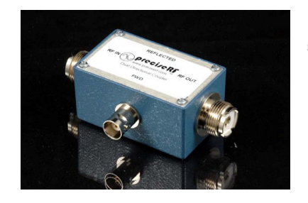
Each DDC-1 Dual Directional Coupler comes completely assembled in a premium shielded die cast aluminum alloy A380 housing. The housing is blue baked enamel per Federal Standard 595 #25109 over primer wash per DOD-P-15328.

While carefully calibrated at the factory, the DDC-1 may be custom calibrated to meet your special application by adjusting C1. CAUTION: This calibration is only recommended for users who are skilled in making precision high frequency spectrum analyzer and tracking generator measurements.